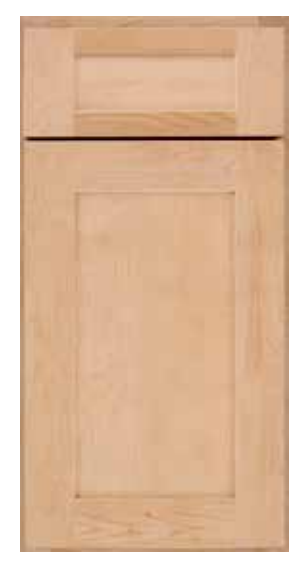
TOBIN (M) solid slab drawer front is standard