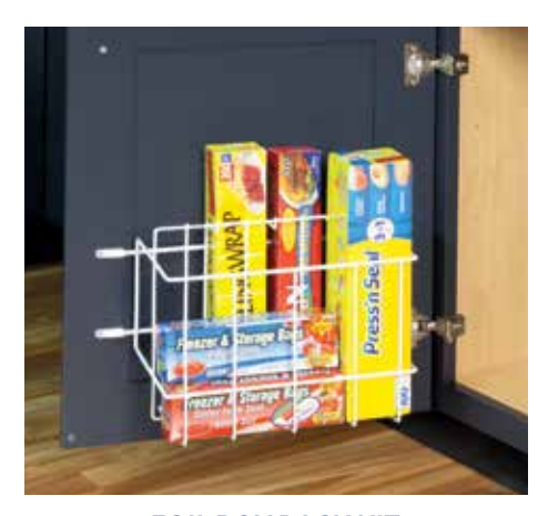
FOIL BOX RACK KIT