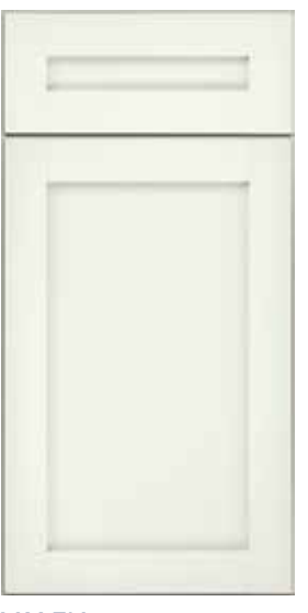
VALEN (LM) solid slab drawer front is standard