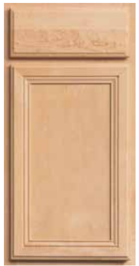
\textbf{GABRIEL} \; (\text{M})

Cabinet doors are a defining feature of your cabinetry. They are often the first thing you and your guests notice when admiring your cabinetry.