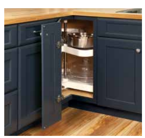
BASE CORNER REVOLVING