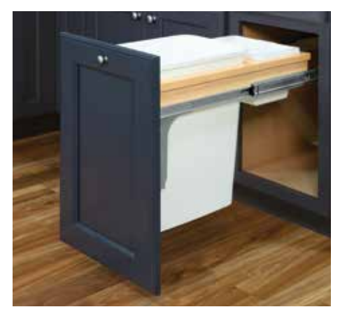
BASE WASTEBASKET TOP MOUNT