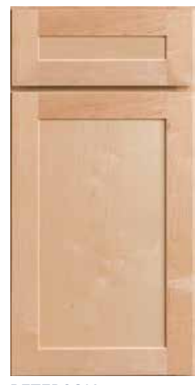
PETERSON (M,C) solid slab drawer front is standard