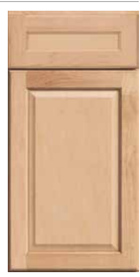
FELIX (M,C) solid slab drawer front is standard