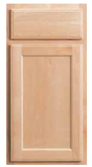
\textbf{SKYLAR} \; (\text{M,O,C})