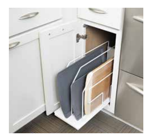
TRAY DIVIDER ROLL-OUT