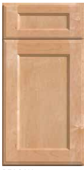
REAGAN (M) solid slab drawer front is standard