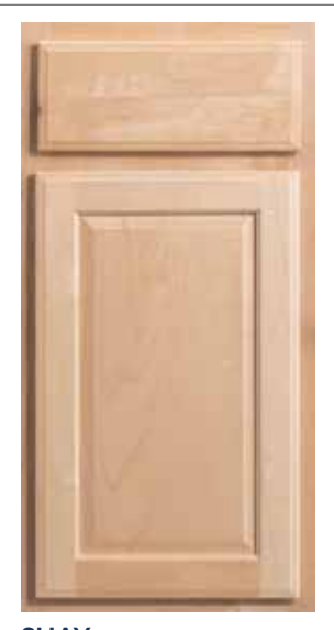
\textbf{SHAY} \; (\text{M,O,C})