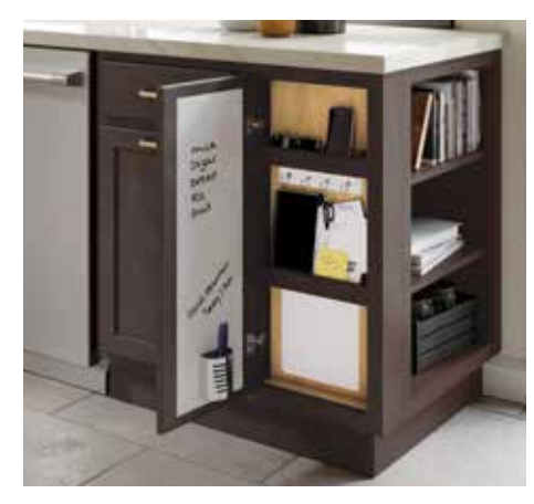
MESSAGE CENTER WALL