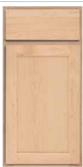
\textbf{McGRATH} \; (\mathsf{M})