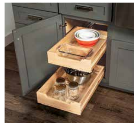
DELUXE ROLL-OUT TRAYS

For more accessories, visit www.qualitycabinets.com